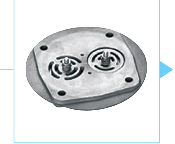
VALVES & PLATE ASSEMBLY The large valves ensure low pressure drop and reduced

oncept (two stages in a single high efficiency.